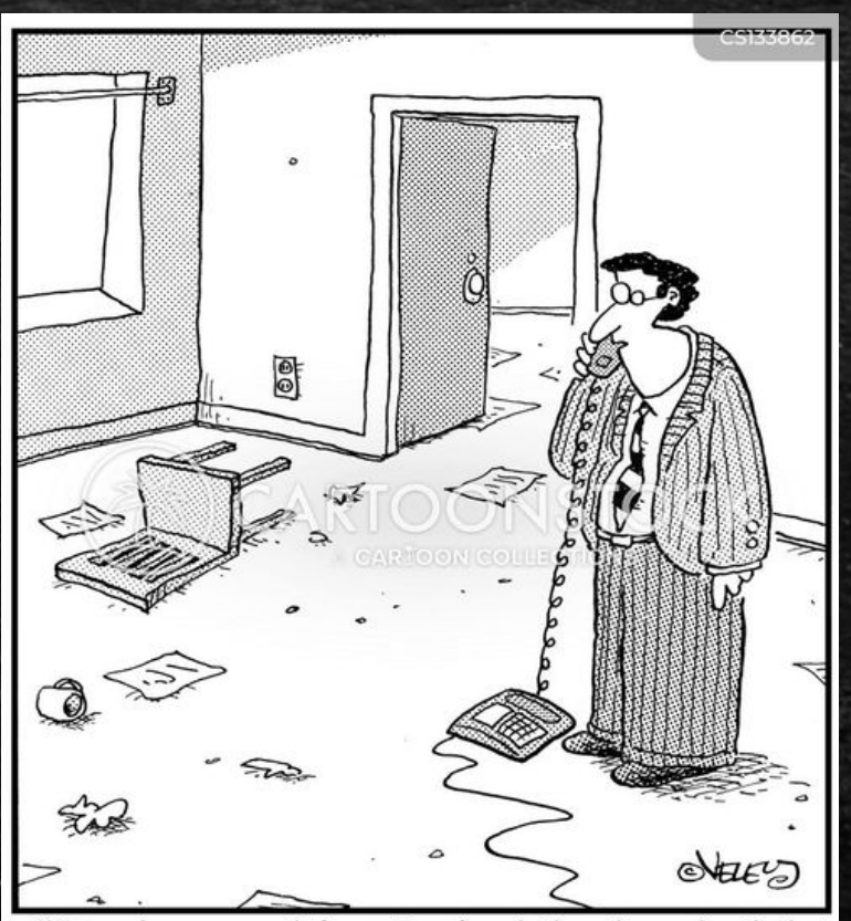
"I took your advice. I seized the day. And the day responded by seizing all of my assets!"